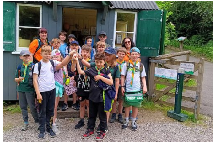
The Purbeck Mining Museum recently welcomed 226 cub scouts, scouts, explorers and leaders from the Bournemouth District Scouts Association.

The Purbeck Mining Museum is attracting more and more group visits as the venue continues to build on its popularity as an important educational and heritage attraction. Later this summer, plans are already in place to welcome many school groups, a large group of brownies as well as various local history and industrial heritage groups. Such group visits are dependent, however, on having enough visitor reception guides and marshals at the museum as the venue is run entirely by volunteers. If you are interested in joining the friendly group of volunteers just visit http://purbeckminingmuseum.org/contact-us/ to find out more.