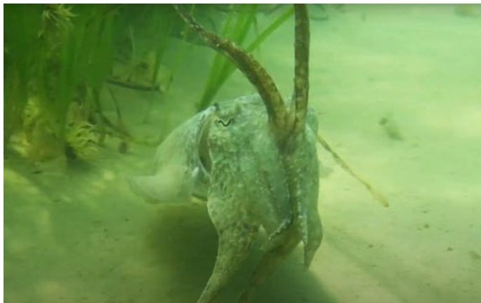
Cuttlefish in Studland Bay

It includes superb underwater shots of seahorses, cuttlefish and Studland's seagrass meadow. Neil Garrick-Maidment, of the Seahorse Trust , describes the scene as “like swimming through a beautiful forest”.