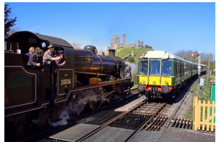
First train from Wareham arrives at Corfe Castle, 4 April 2023

Anyone interested in volunteering should contact the Swanage Railway volunteer recruitment and retention office on 01929 475212 or email iwanttovolunteer@swanagerailway.co.uk . Details about volunteering opportunities can be found at swanagerailwaytrust.org/volunteering .