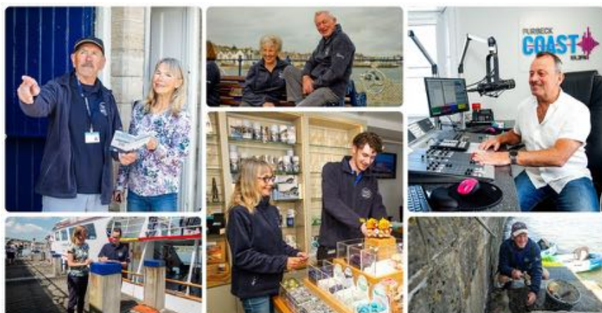
Volunteering at Swanage Pier

Visit our events page for full details for all our events that are happening in May - www.swanagepiertrust.com/events.aspx