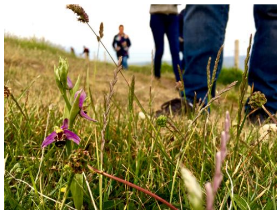
Bee orchids found at volunteers' plant survey

From the Trust's perspective – if you are interested in volunteering with us please do get in touch, particularly if you fancy working with visitors at Corfe or Studland. We'll make sure our vacancies are on the Swanage Volunteer Bureau database, and you could also check our website.