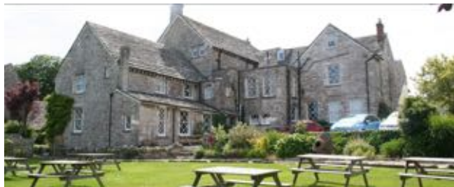
The Old Malthouse