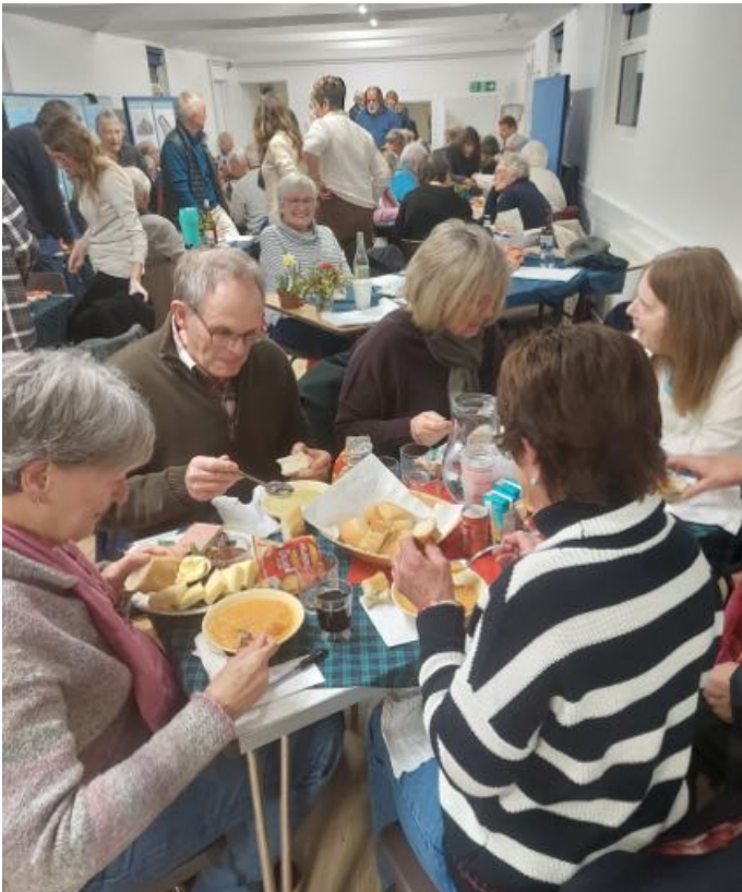
Folk having a happy, fun-filled evening Quiz Night at Herston Hall which raised over £300