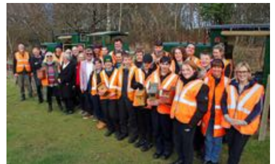
The Sygnets, the Swanage Railway youth volunteers, have supported the woodland management activities of the Purbeck Mining Museum by making bird boxes that have now been installed around the site – photo courtesy of Andrew P.M. Wright.

Ron Dyson: 01935 83622; ron.dyson@auroracomms.net