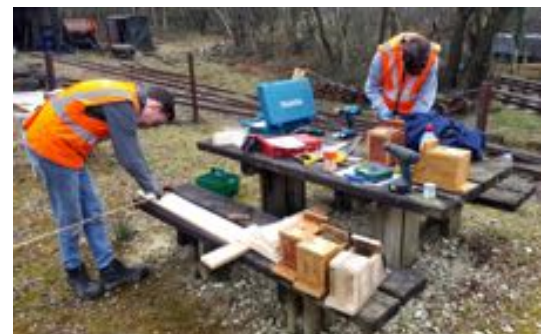
The Sygnets, the Swanage Railway youth volunteers making bird nest boxes at the Purbeck Mining Museum earlier in February