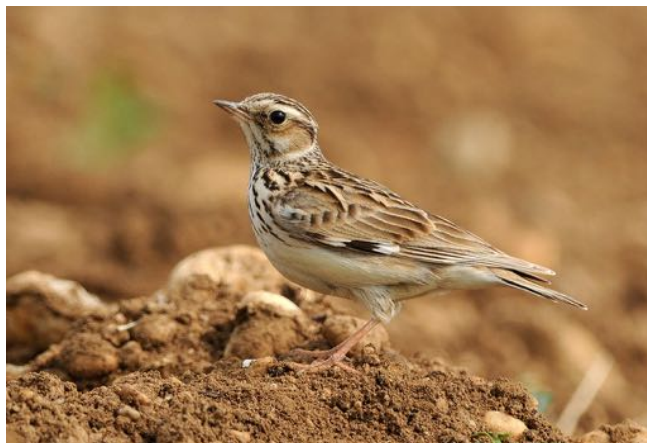
Woodlark

Best wishes from the Dorset National Park Team