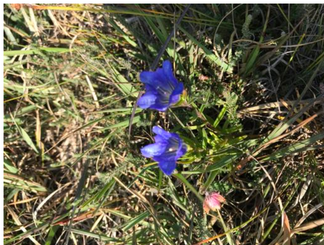
Marsh gentian