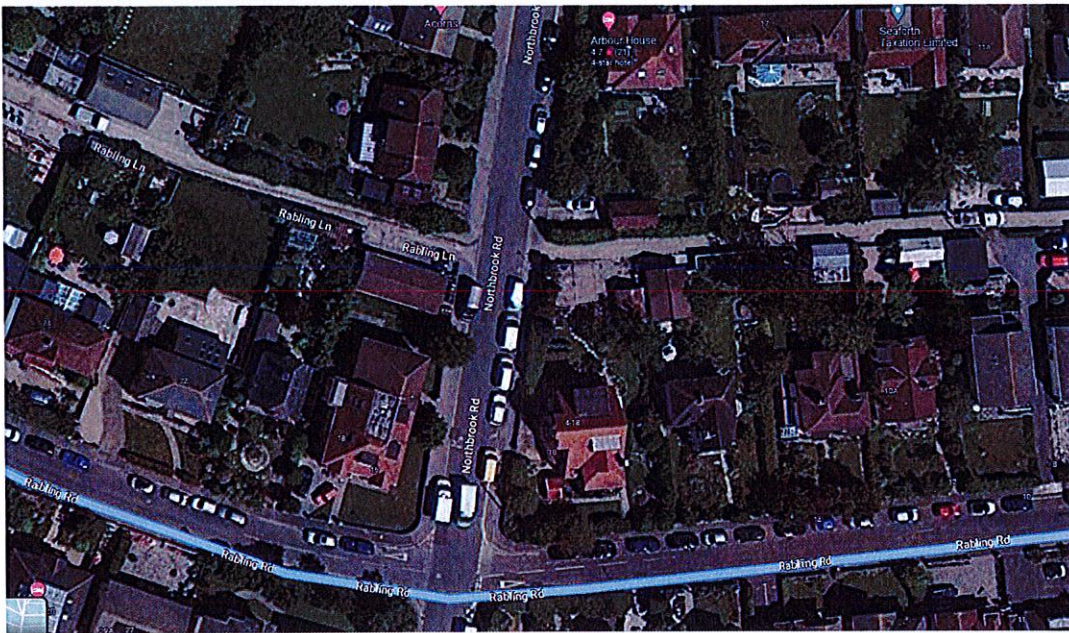
No. 2 Rabling Lane onto Northbrook Road