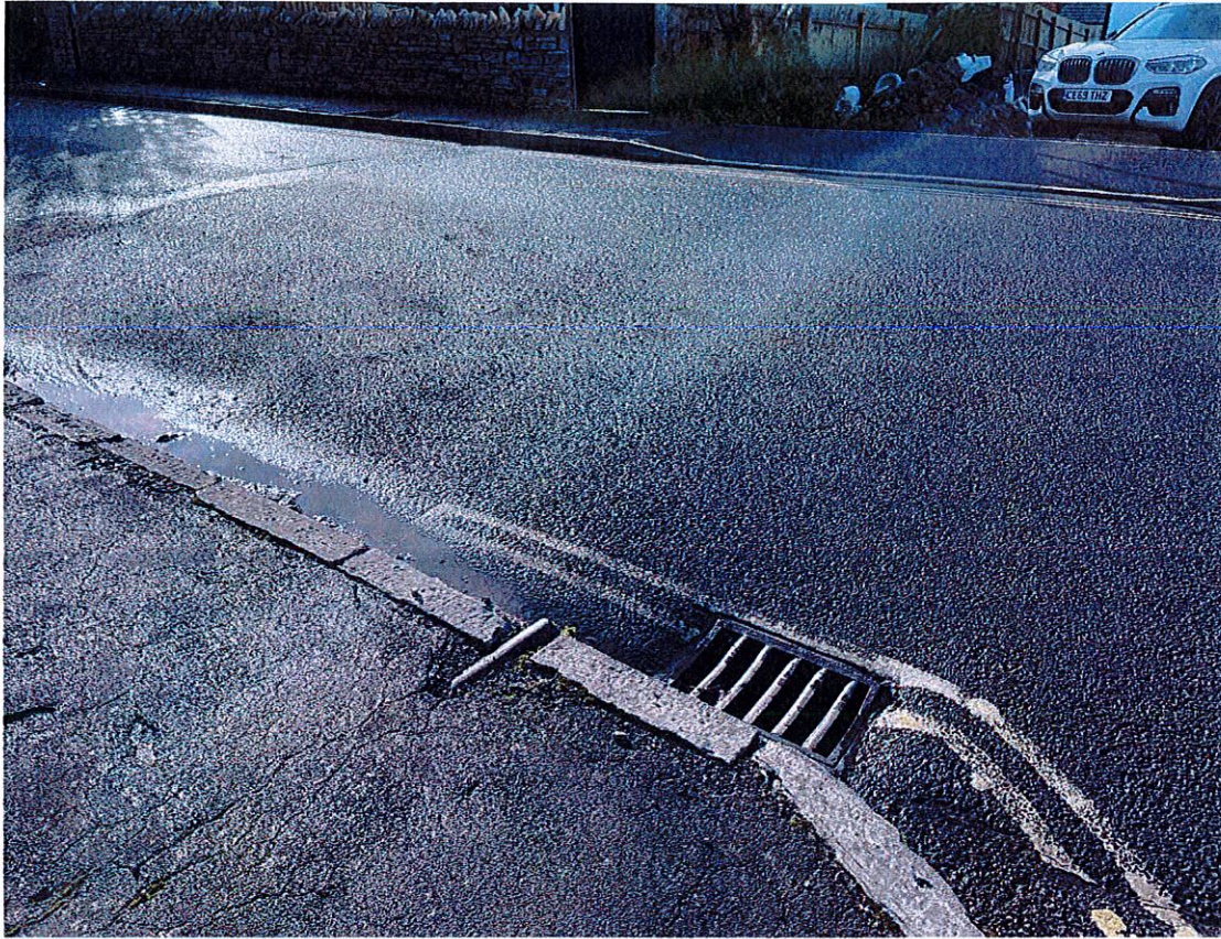
Images from resident regarding visibility at junction of Rabling Lane and Rabling Road