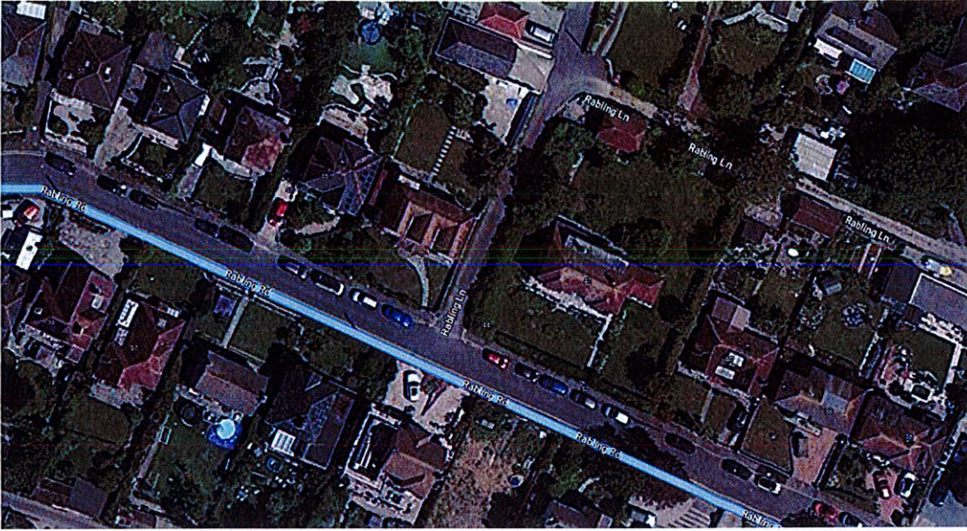
No. 1 Rabling Lane onto Rabling Road