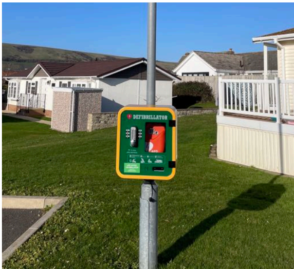
The Defib at Cauldron Barn Park in Swanage