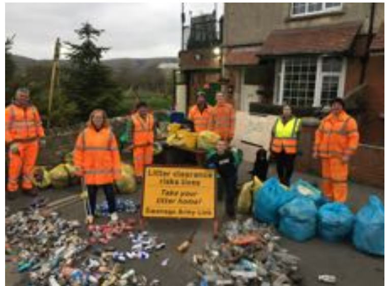
Our wonderful crew at a recent audit of spring clean litter