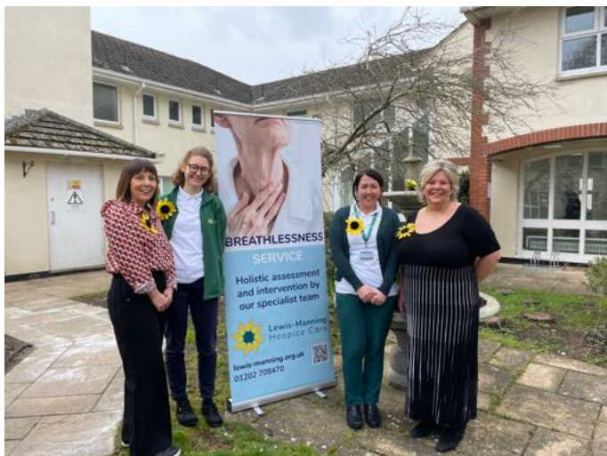
The launch of the new Lewis Manning Breathlessness Clinic on March 15th 2023 which the Friends have been pleased to support.