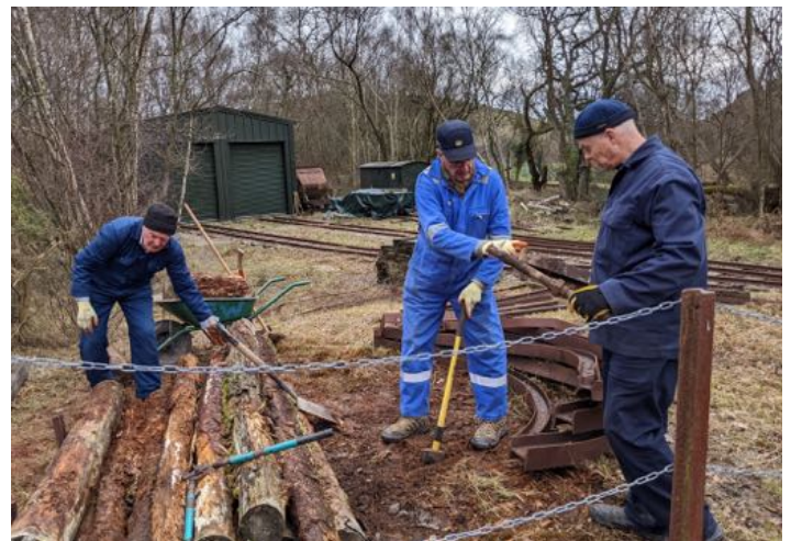
Volunteers play a central role in all activities at the Purbeck Mining Museum - including woodland and landscape management.

ALCOHOLICS ANONYMOUS® is a fellowship of men and women who share their experience, strength and hope with each other that they may solve their common problem and help others to recover from alcoholism. ... Our primary purpose is to stay sober and help other alcoholics to achieve sobriety.