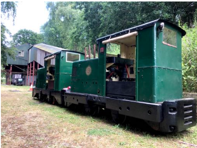
The Purbeck Mining Museum at Norden, features a recreated clay mine and periodic demonstration days on the restored narrow gauge tracks.

The Purbeck Mining Museum is extending opening times this year and is always looking for new volunteers with a wide range of skills who have an interest in local history and the local ecology and who enjoy meeting people. For further information on volunteer opportunities at the museum please visit http://purbeckminingmuseum.org/join-us/ or come along to Norden and meet the team at one of the museum's 'Volunteer Fridays'.